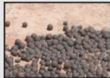
Earth or Mars?